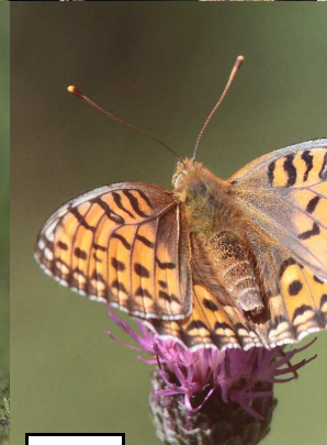
15 - H