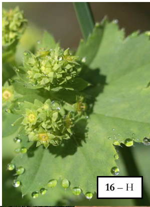
16 - H