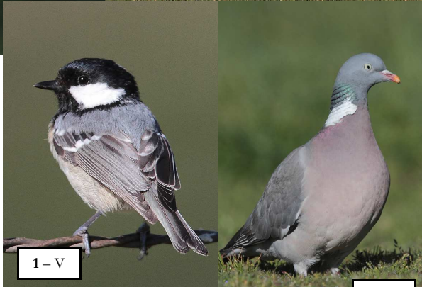
1 - V