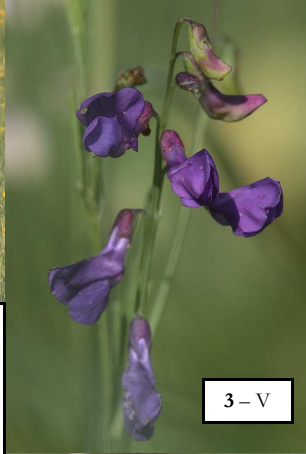
3 - V