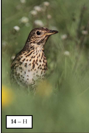
14 - H