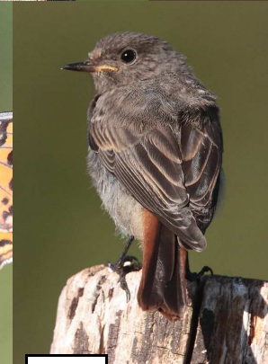
5 - V