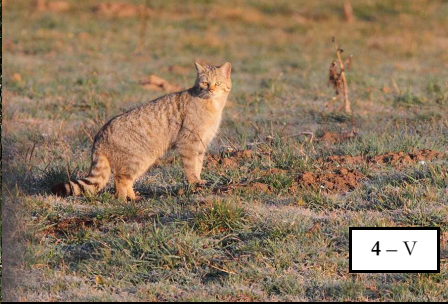
4 - V