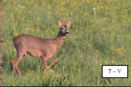
7 - V