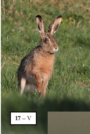
17 - V