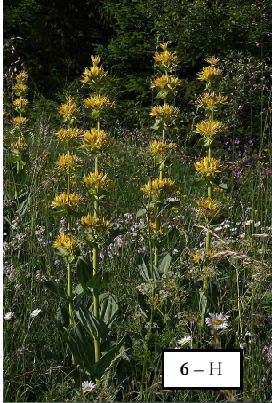
6 - H