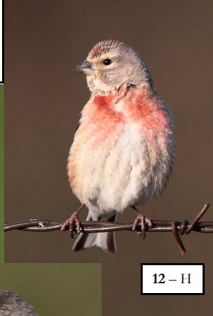
12 - H