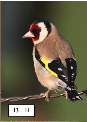
13 - H