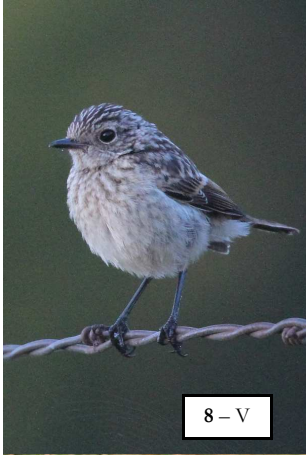
8 - V