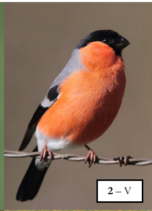
2 - V