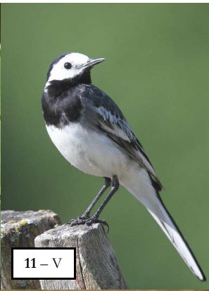
11 - V